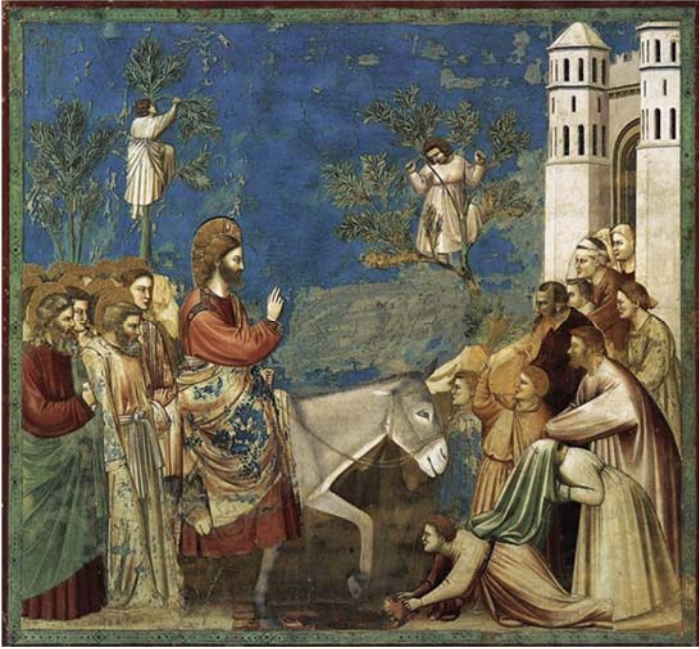
Giotto, Entry Into Jerusalem , 1304

In the fall and winter of 2011, a lot of football fans were caught up in “Tebowmania”—a kind of spiritual giddiness over Denver Broncos quarterback Tim Tebow. Though he had won a Heisman trophy and led the University of Florida to two national championships, Tebow’s limitations as an NFL-quality passer were very much in evidence. Then, in the season of 2011, following a 1-4 start, the Broncos promoted him to starter, and he engineered one miraculous win after another.