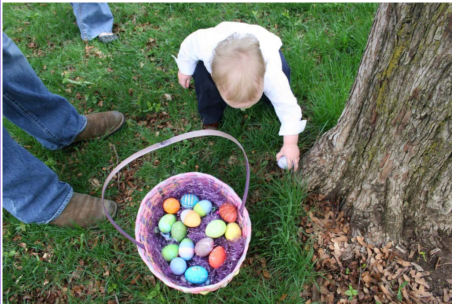
This year we moved our annual Easter Egg Hunt to right after church. We want everybody to enjoy this rite of spring. First, CMF is serving up hot dogs in Fellowship Hall. Then we head outside to cheer on the children as they hunt for eggs and treats.